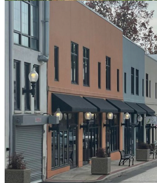
PATH office space in Culpeper